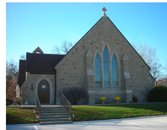
Sacred Heart Church

514 Parker Ave, Osawatomie, KS 66064 https://www.miamilinn Catholics.org/SPN