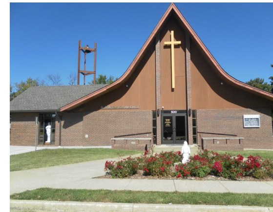
St. Philip Neri Church

St. Philip Neri: 9:30 –10:30am Sundays Sacred Heart: 5:00 - 6:15pm Saturdays O. L. of Lourdes: 9:30 - 10:30am Sundays