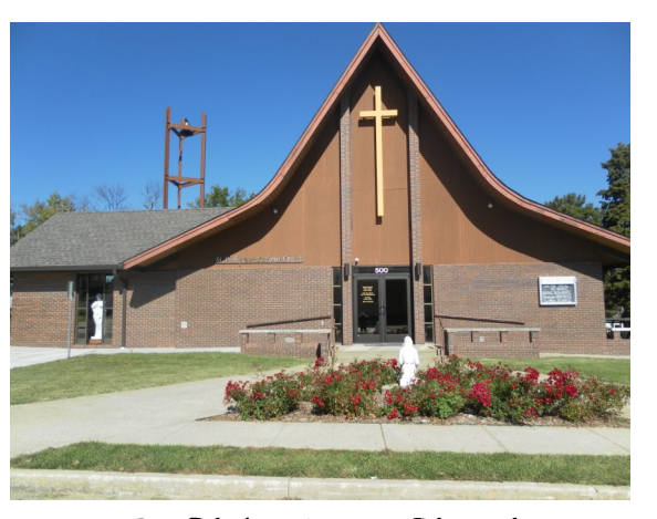
St. Philip Neri Church 514 Parker Ave, Osawatomie, KS 66064 https://www.miamilinncatholics.org/SPN