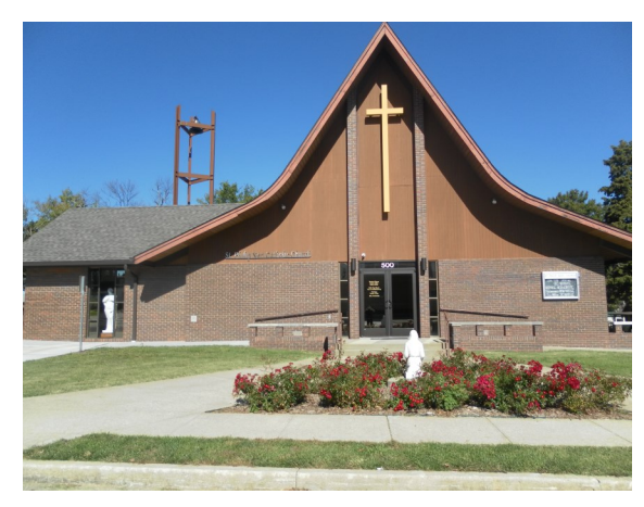
St. Phílíp Nerí Church 514 Parker Ave, Osawatomie, KS 66064 https://www.miamilinncatholics.org/SPN