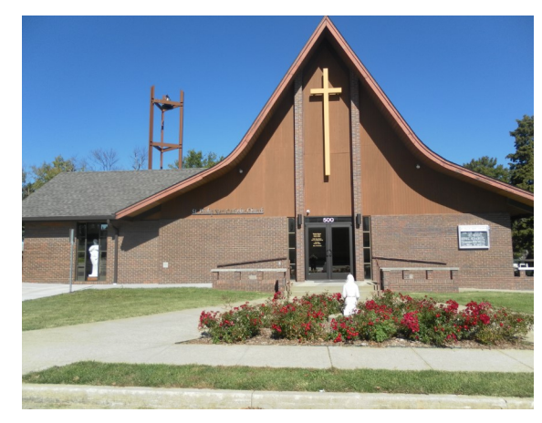
St. Phílíp Nerí Church 514 Parker Ave, Osawatomie, KS 66064 https://www.miamilinncatholics.org/SPN