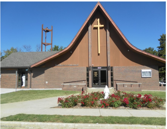
St. Philip Neri Church

St. Philip Neri: 9:30 –10:30am Sundays Sacred Heart: 5:00 - 6:15pm Saturdays O. L. of Lourdes: 9:30 - 10:30am Sundays