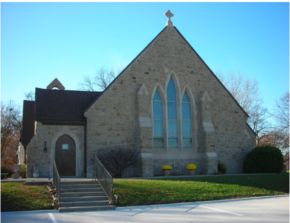
Sacred Heart Church

514 Parker Ave, Osawatomie, KS 66064 https://www.miamilinn Catholics.org/SPN