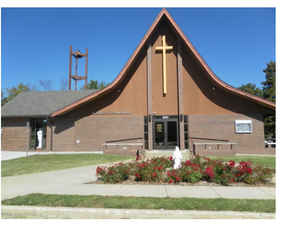
St. Philip Neri Church

514 Parker Ave, Osawatomie, KS 66064 https://www.miamilinncatholics.org/SPN