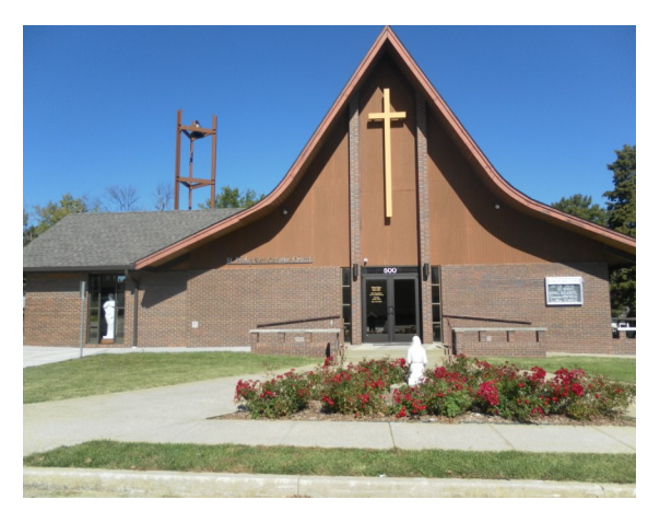
St. Philip Neri Church

514 Parker Ave, Osawatomie, KS 66064 https://www.miamilinncatholics.org/SPN