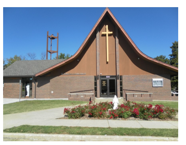
St. Philip Neri Church

514 Parker Ave, Osawatomie, KS 66064 https://www.miamilinncatholics.org/SPN