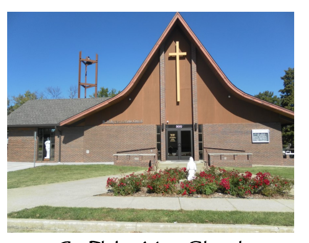
St. Philip Neri Church 514 Parker Ave, Osawatomie, KS 66064 https://www.miamilinncatholics.org/SPN