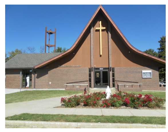
St. Philip Neri Church

514 Parker Ave, Osawatomie, KS 66064 https://www.miamilinncatholics.org/SPN