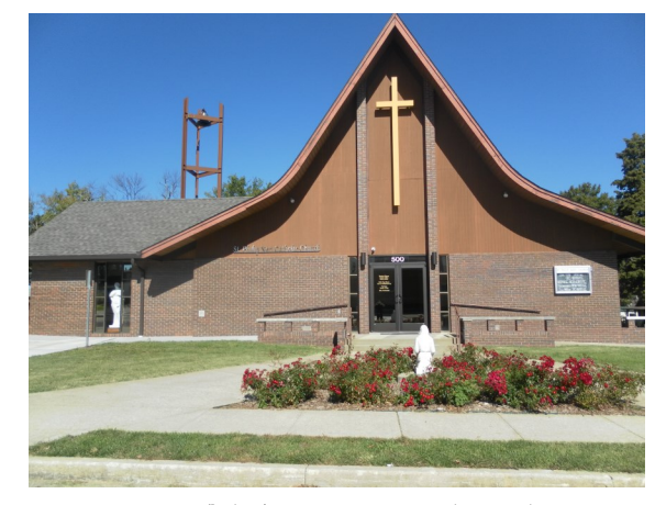
St. Phílíp Nerí Church 514 Parker Ave, Osawatomie, KS 66064 https://www.miamilinncatholics.org/SPN