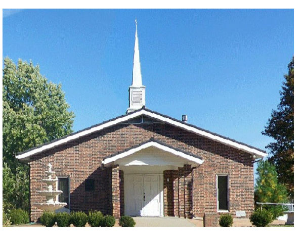
Our Lady of Lourdes Church 819 N 5th St, LaCygne, KS 66040 https://www.miamilinncatholics.org/OLL

Sacred Heart Church (St. Rose Philippine Duchesne Shrine) 729 W Main St, Mound City, KS 66056 https://www.miamilinncatholics.org/SH