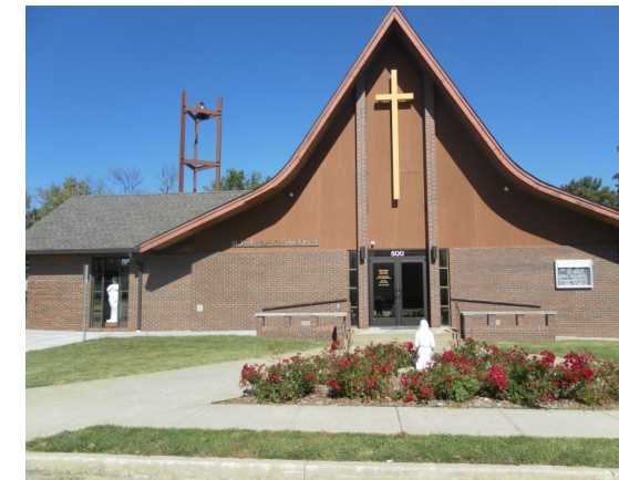
St. Philip Neri Church

St. Philip Neri: 9:30 –10:30am Sundays Sacred Heart: 5:00 - 6:15pm Saturdays O. L. of Lourdes: 9:30 - 10:30am Sundays