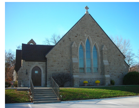
Sacred Heart Church (St. Rose Philippine Duchesne Shrine)

514 Parker Ave, Osawatome, KS 66064 https://www.miamilinn Catholics.org/SPN