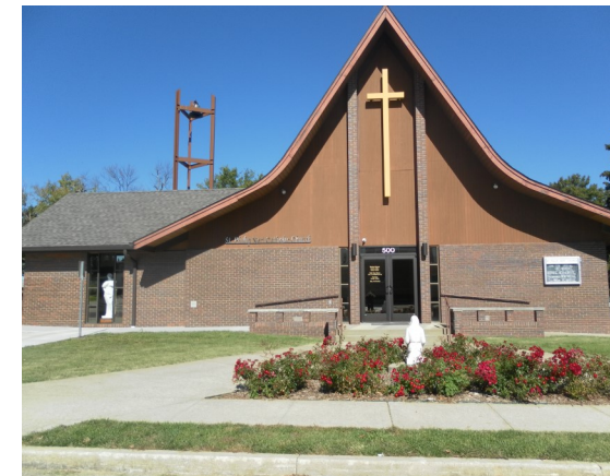
St. Philip Neri Church 514 Parker Ave, Osawatome, KS 66064 https://www.miamilinn Catholics.org/SPN