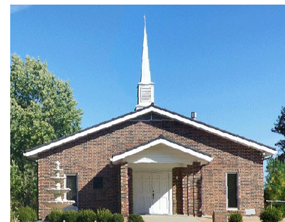
Our Lady of Lourdes Church 819 N 5th St, LaCygne, KS 66040 https://www.miamilinn Catholics.org/OLL