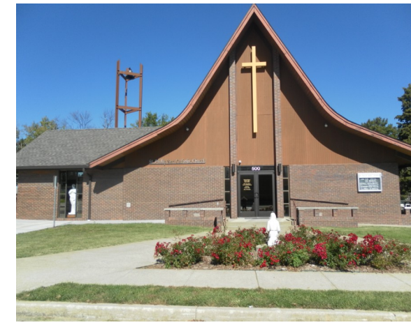
St. Philip Neri Church 514 Parker Ave, Osawatomie, KS 66064 https://www.miamilinn Catholics.org/SPN