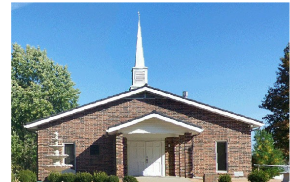
Our Lady of Lourdes Church 819 N 5th St, LaCygne, KS 66040 https://www.miamilinn Catholics.org/OLL