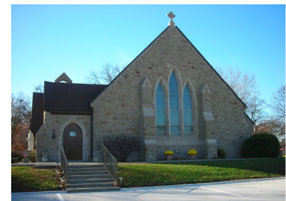
Sacred Heart Church (St. Rose Philippine Duchesne Shrine) 729 W Main St, Mound City, KS 66056 https://www.miamilinn Catholics.org/SH