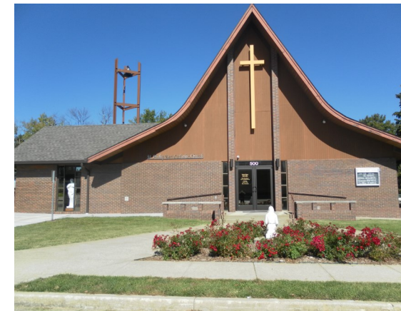
St. Philip Neri Church 514 Parker Ave, Osawatomi, KS 66064 https://www.miamilinn Catholics.org/SPN