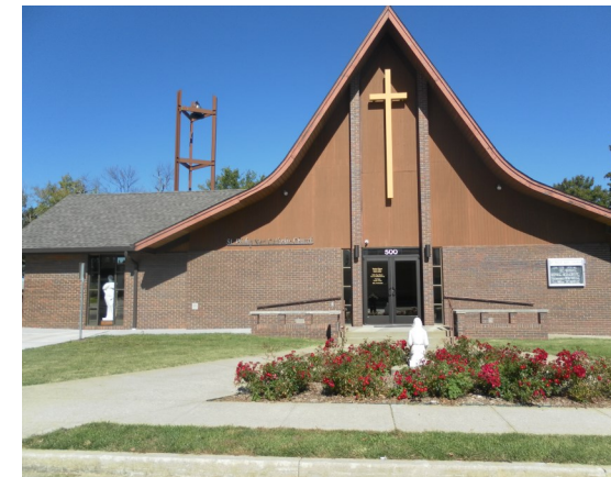
St. Philip Neri Church 514 Parker Ave, Osawatomie, KS 66064 https://www.miamilinn Catholics.org/SPN