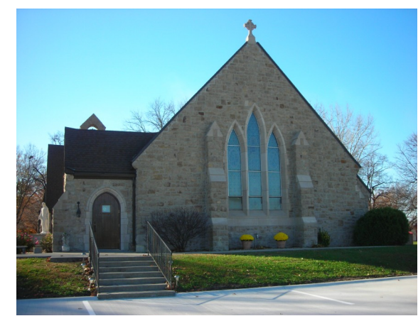
Sacred Heart Church

514 Parker Ave, Osawatomie, KS 66064 https://www.miamilinn Catholics.org/SPN