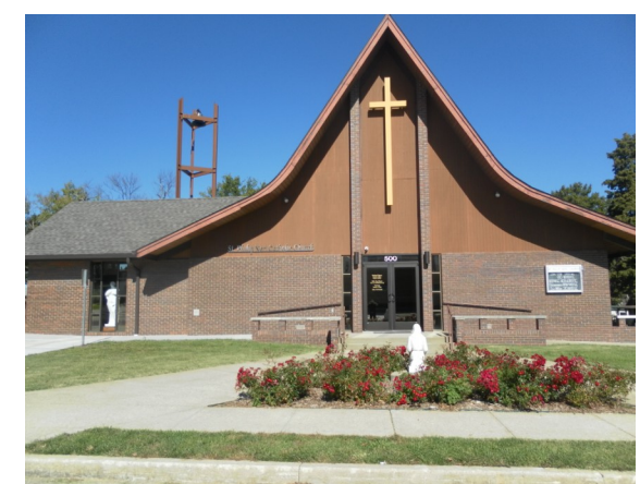
St. Philip Neri Church

January 27, 2019 Third Sunday in Ordinary Time